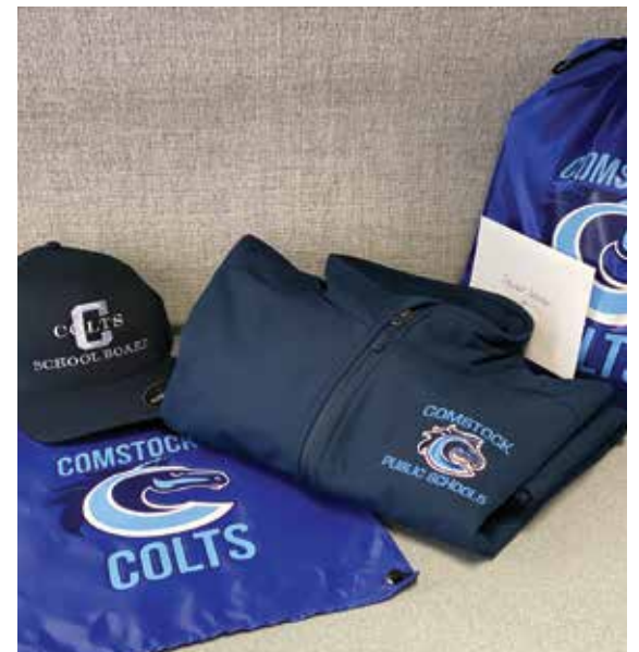
Each board member received these gifts.