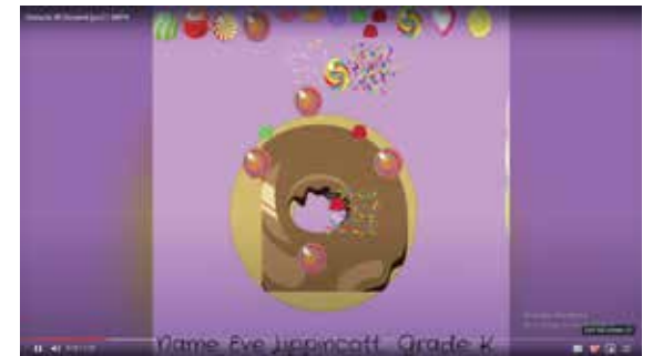
Eve Lippincott's digital donut for Digital Donuts With Grownups Day.