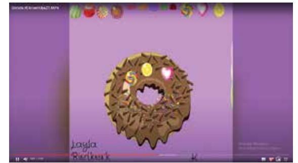
Layla Rielker's digital donut.