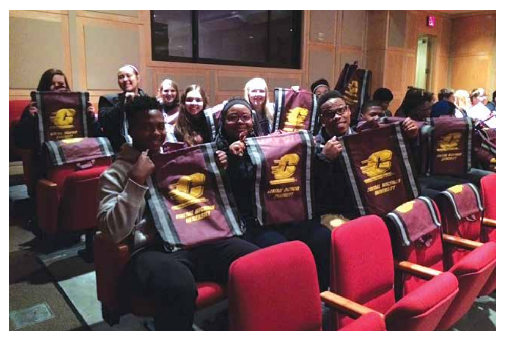
CHS students show off the CMU bags they received on a visit to the Mount Pleasant college campus.

CHS students said the experience was extremely beneficial to their college search and decision making process.