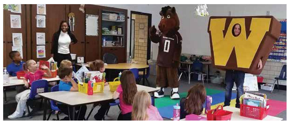
Buster the Bronco from Western Michigan University visited classrooms to encourage students to work hard and dream big.

We look forward to College Awareness Month next year and hope to encourage even more participation.