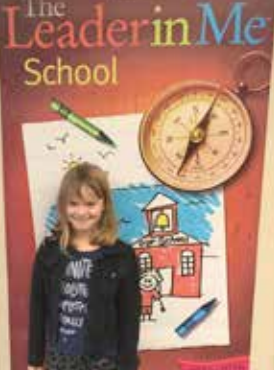
"I am a leader because I stay focused when I need to work hard for my school."