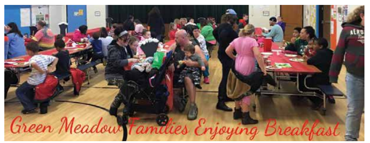
Green Meadow students and their families enjoy a pancake breakfast with Santa.

Santa Claus visited Green Meadow to have breakfast and chat with students and their families. Over 200 people enjoyed a delicious breakfast of pancakes provided by Julianna's Restaurant.