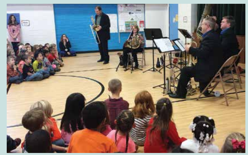
The Kalamazoo Symphony Brass Quintet recently shared their musical knowledge with students.