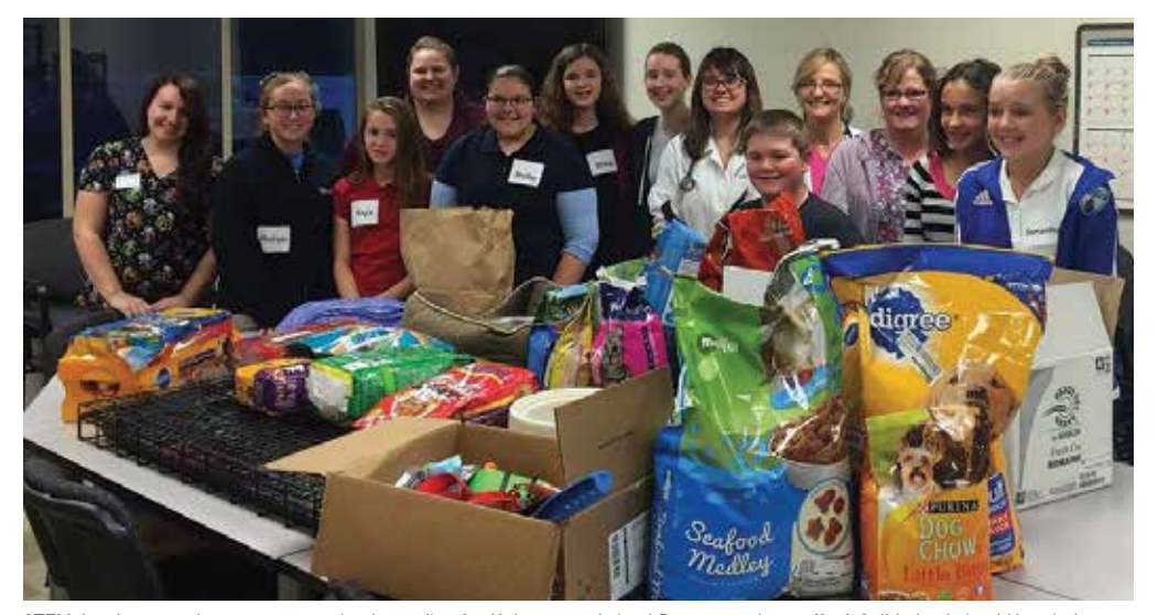
STEM Academy students present animal supplies for Kalamazoo Animal Rescue to the staff of Gull Lake Animal Hospital.

Perhaps best of all, STEM Academy students learned that it feels just as good to give as it does to receive.