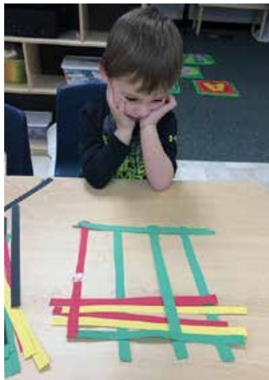
Blake Ponton contemplates a fabric weave.

As part of the clothing unit in CELA's Creative Curriculum, students made paper clothing and learned about other tasks related to clothes. They made paper weaves that simulated clothing weaves, pretended to wash and dry laundry, and ironed and hung up clothing. Students even helped make homemade laundry soap.