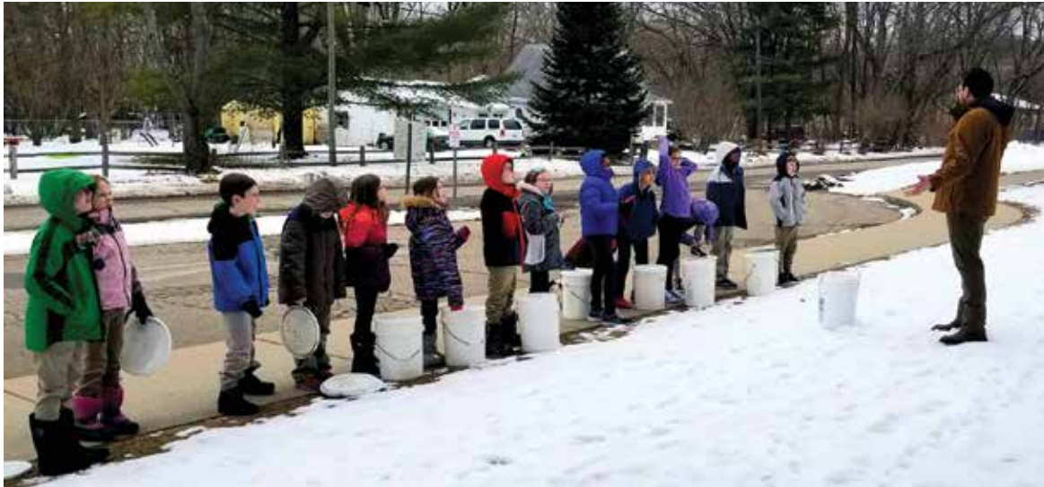
Third graders get final directions before tapping the trees.

Finally, everyone sampled their hard work with a pancake/maple syrup celebration.