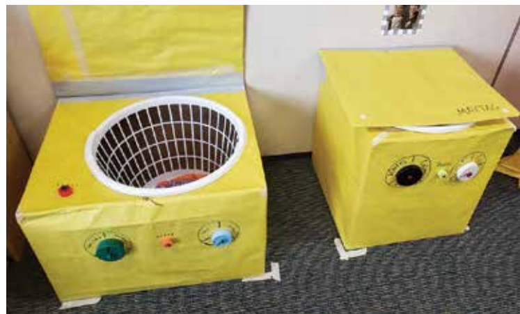
This washer and dryer were created for Dramatic Play in one Great Start Readiness Program (GSRP) classroom.