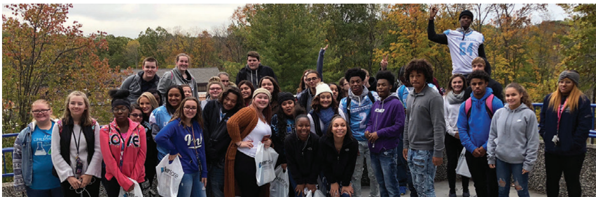
Comstock students visited Grand Valley State University during College Month.

College Exposure: Representatives from 16 different postsecondary institutions visited the high school during October for their annual visits. These