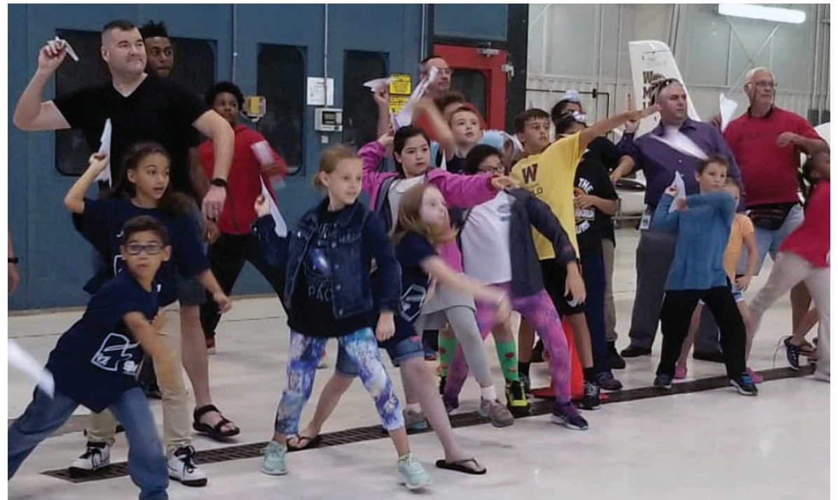
Participants prepare to throw their paper airplanes to see whose can go the farthest.