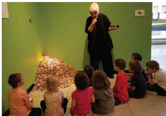
Kindergartners pondered the meaning of candy with a KIA docent.

and has been shown in at least 50 locations around the world. According to the KIA website, "Each do it exhibition is uniquely site-specific because it engages the local community in a dialogue that responds to and adds a new set of instructions, while it remains global in the scope of its ever-expanding repertoire."