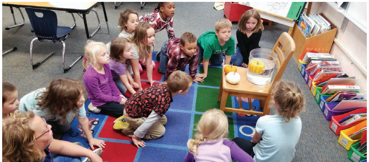
Miss Kimmer's class watches to see if the pumpkin floats.

The pumpkins were also put through a float test with students predicting whether or not the pumpkins would float. They were wide-eyed to discover that pumpkins do float.