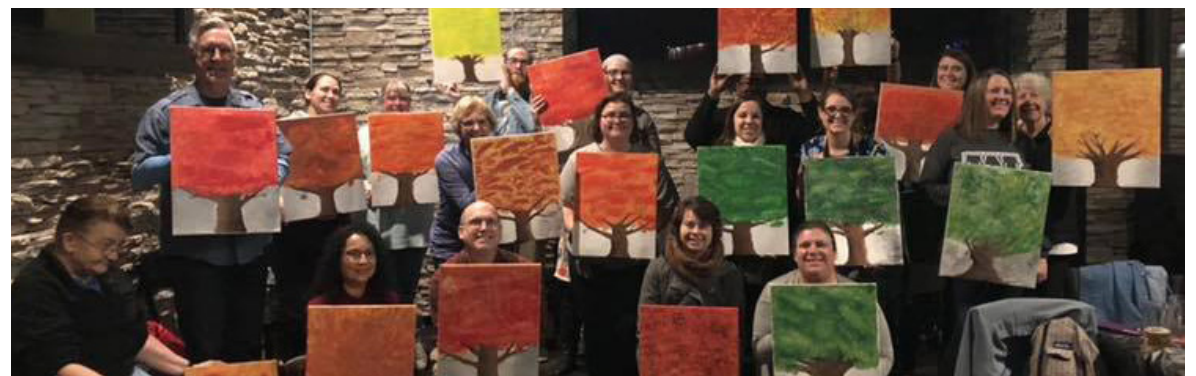
The artists display their happy little trees.

Everyone was happy to take home their own work of art.