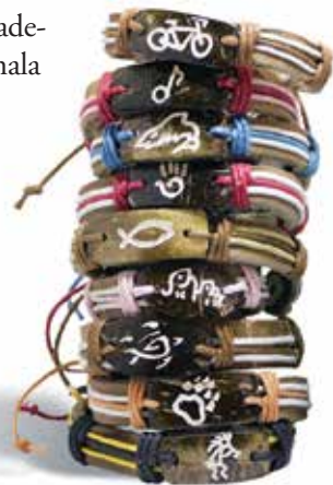
Yuda Bands will be sold to help send a student to school in either Guatemala or Zimbabwe.

If you'd like to learn more about the Yuda Band project, here is their website: https://www.yudabands.org/