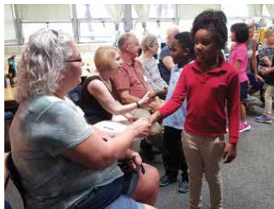
Third grade students introduced themselves and welcomed each grandparent to the event.