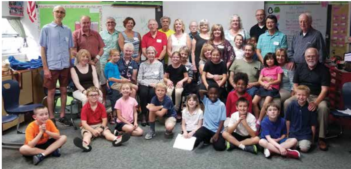
Students and their grandparents gather for a group photo at the Grandparents Day tea.