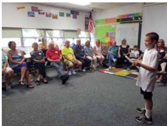
Each student stood up to ask a question about what third grade was like for the grandparents.