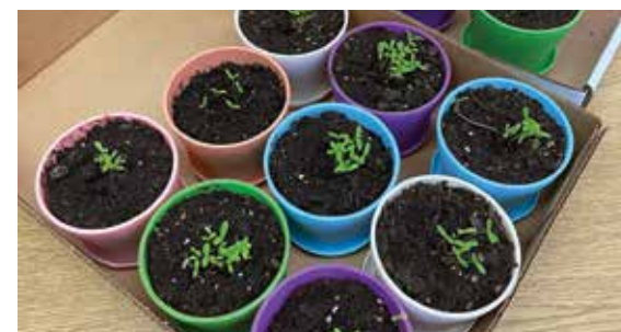
Seeds planted on Earth Day are finally sprouting.