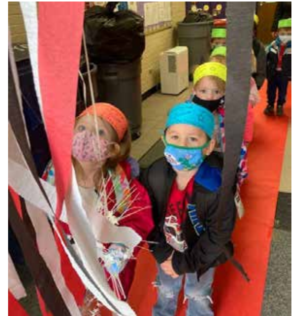
During Week of the Young Child, Head Start students walk through streamers at the entrance to CELA.

The Week of the Young Child uses a variety of hands-on activities featuring music, food, and art, all designed to encourage movement and healthy lifestyles. Themes during the week include Music Monday, Tasty Tuesday, Work Together Wednesday, Artsy Thursday, and Family Friday.