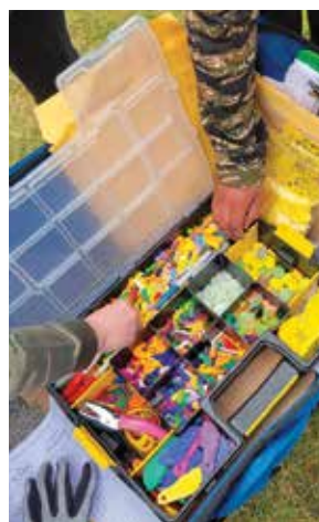
Students choose a foot token after completing a mile.

Feelin' Good Mileage Club returned to Comstock Elementary School this spring following a year's hiatus due to the pandemic.