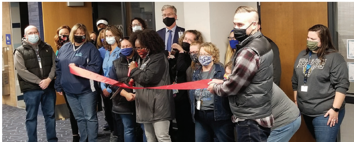
The ribbon cutting ceremony lasted only a minute.

School board members and a few community members toured the area. Construction will continue in other areas of CES throughout the school year. Currently the cafeteria area, locker room