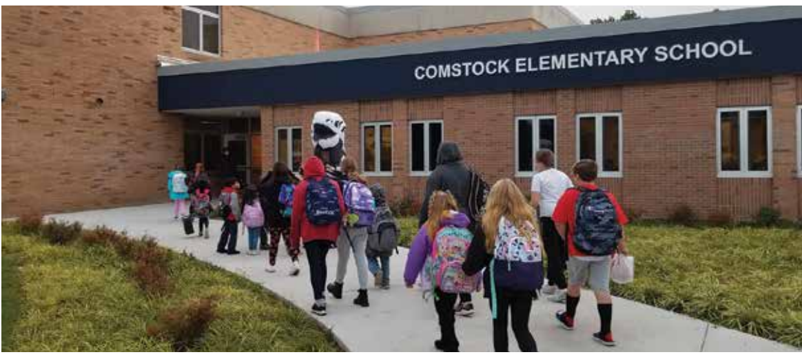
Students were greeted with a Jurassic Hug on the day of the Parade.