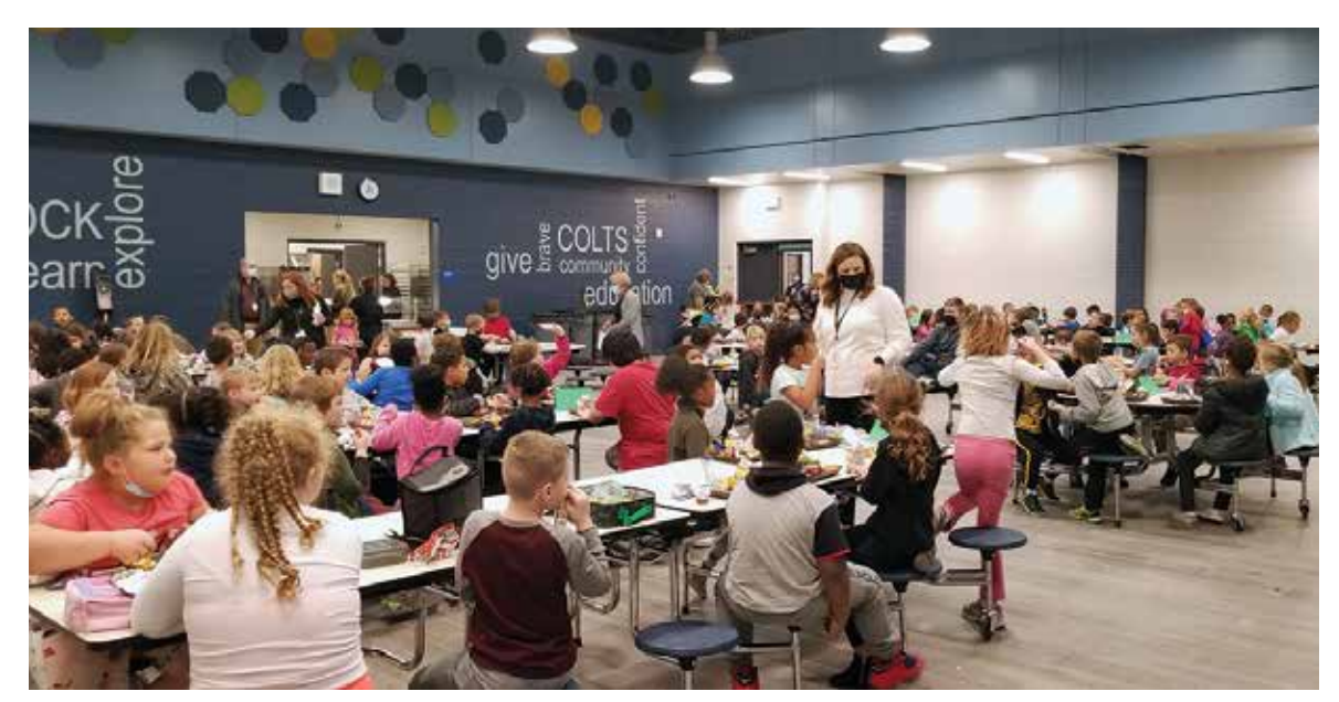
Students and staff eat lunch time for the first time in CES's new cafeteria.

Elementary students ate in their new cafeteria for the first time in November. The week before the opening, teachers discussed with students the expectations about eating in the new cafeteria.