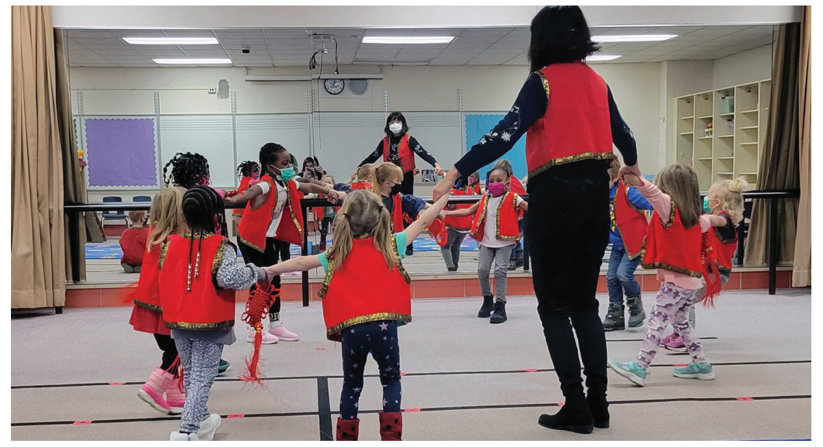
CELA students learn a traditional Chinese dance which they performed at the Chinese New Year Gala at WMU.

CELA students in the Great Start Readiness Program (GSRP) learned a traditional dance to celebrate the Chinese New Year. They performed their dance at the Chinese New Year Gala at Western Michigan University hosted by the university's Asian Initiatives.