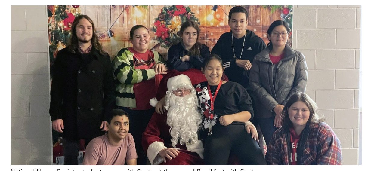
National Honor Society students pose with Santa at the annual Breakfast with Santa.

Over 300 people attended the annual "Breakfast with Santa" event at the elementary school before the holiday break. The breakfast, hosted by the staff, featured pancakes and sausage served in the newly remodeled cafeteria.