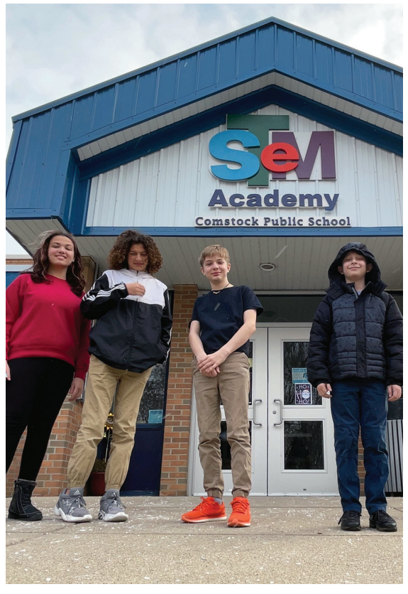
STEM Academy students took state honors in the Samsung Solve for Tomorrow contest.

Ten national finalists will compete in the spring.