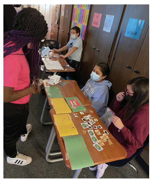
Students "sell" foods from their food trucks.

Sixth and grade eighth students at the STEM Academy recently explored various options for their upcoming high school