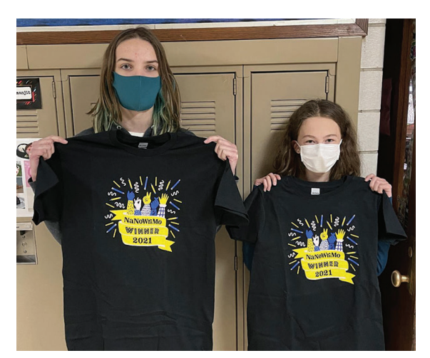
STEM eighth graders with the t-shirts created for National Novel Writing Month.

STEM eighth graders wrote novels in November as participants in National Novel Writing Month (NaNoWriMo), a program that challenges people to write a novel in 30 days.