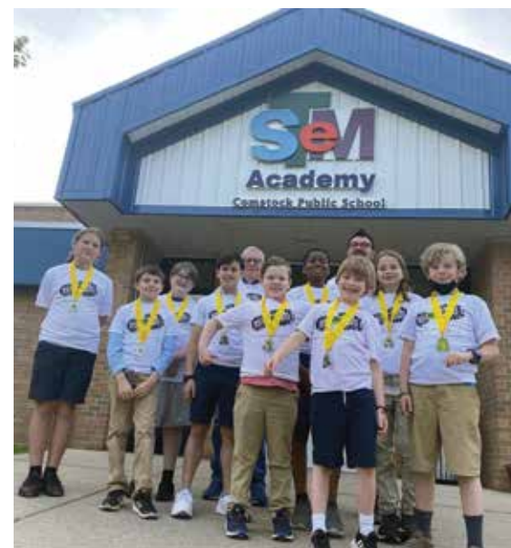
Comstock STEM fourth through sixth graders finished the season of Let Me Run with a 5K (3.1 miles) run.

Girls from the elementary school participating in Girls on the Run ran in the Greater Kalamazoo 5K at Kalamazoo Valley Community College. Even though it was raining, they ran and