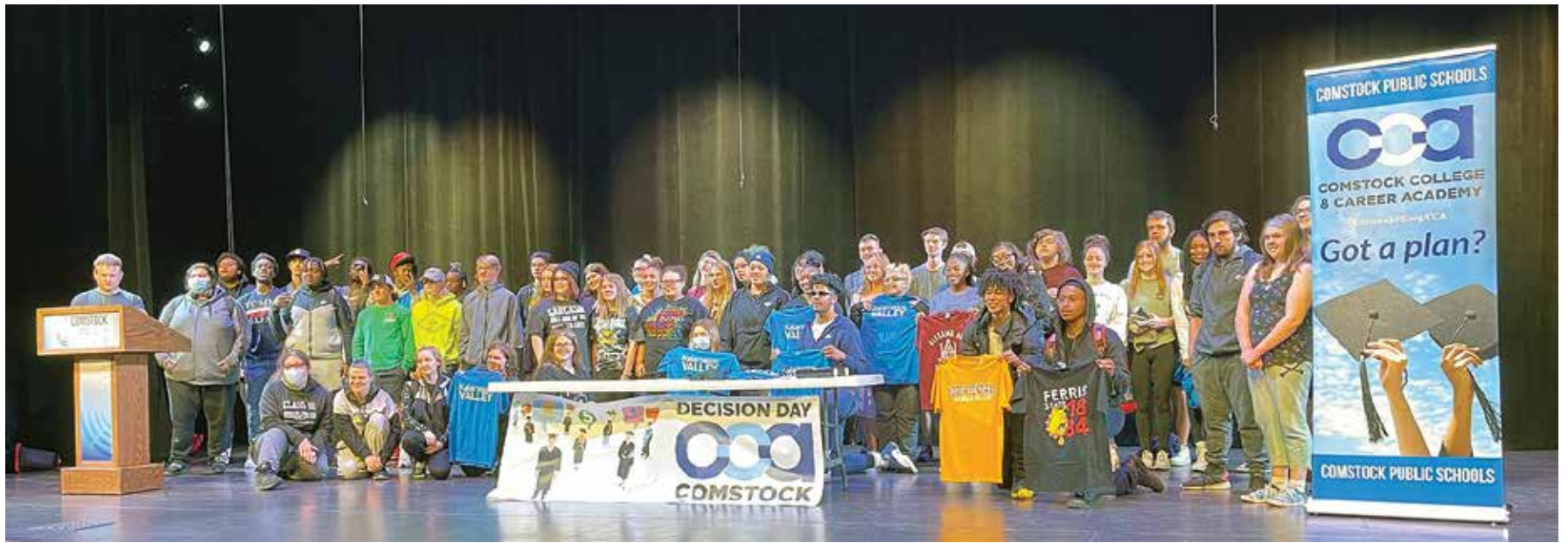
Seniors display university t-shirts and other tokens indicating their future plans.

Post-secondary plans of this year's senior class were highlighted during the annual Decision Day. Many different post-high school plans were represented including two and four-year colleges, apprenticeships in the skilled trades, military service and the general workforce.