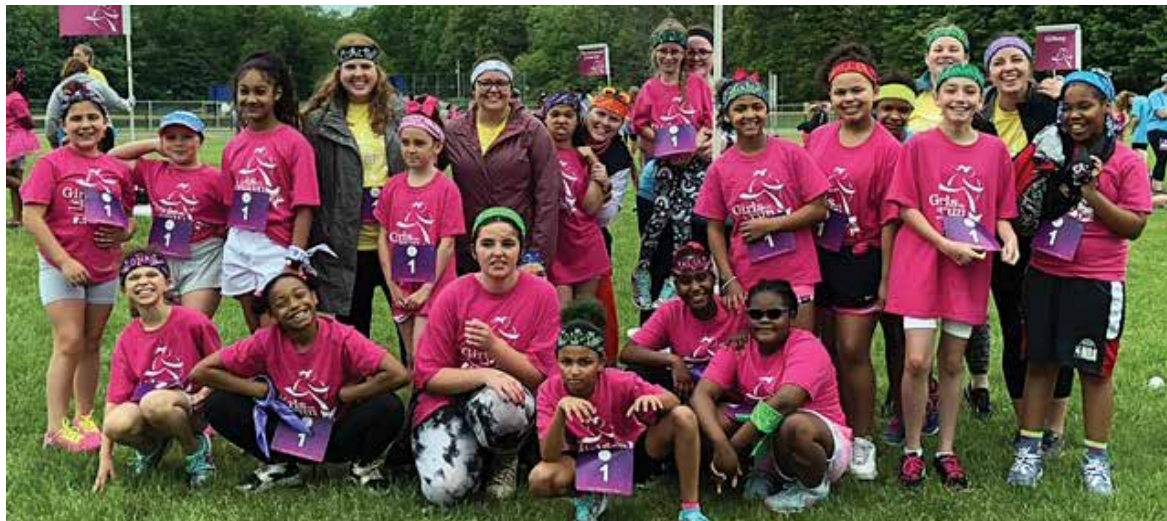
Girls on the Run finished their season with a 5K run.

Runners in both the Let Me Run and Girls on the Run programs finished the season last spring with a 5K run.