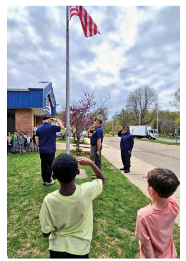
Veterans and STEM Academy students salute the school's new flag donated by American Legion Westnedge Post 36.

The American Legion Westnedge Post 36 recently donated a new American flag to the STEM Academy to replace the old one that was torn and tattered.