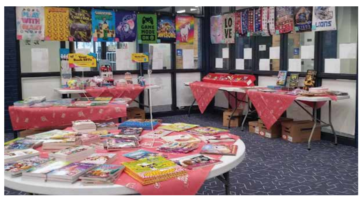
Colorful books fill the tables at the Book Fair, just waiting to get into the hands of eager students.

The CES Library has been able to purchase new books due to the Book Fairs and various donations.