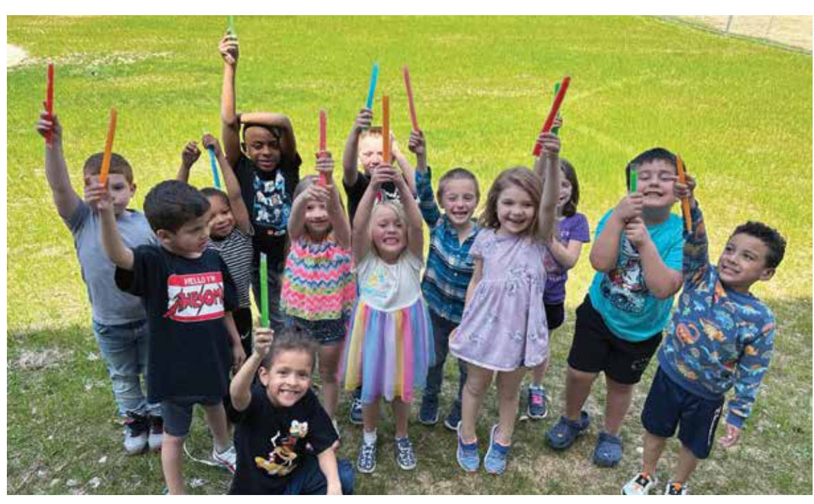
Miss Buscher's class enjoy their popsicles after having achieved their WIG math goals.

Students from age 4 to 18 may participate in the event. In the 60-second games, students are tested on accuracy and speed.