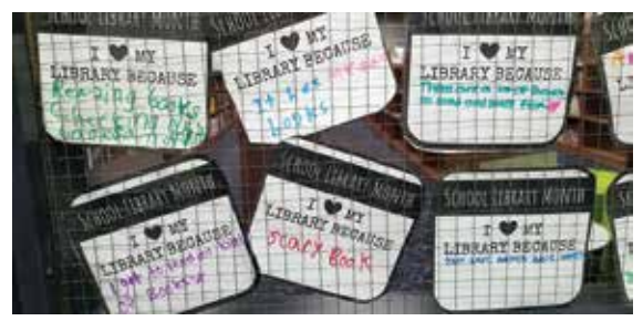
On display for School Library Month were students' handwritten notes on "Why I Love my School Library."