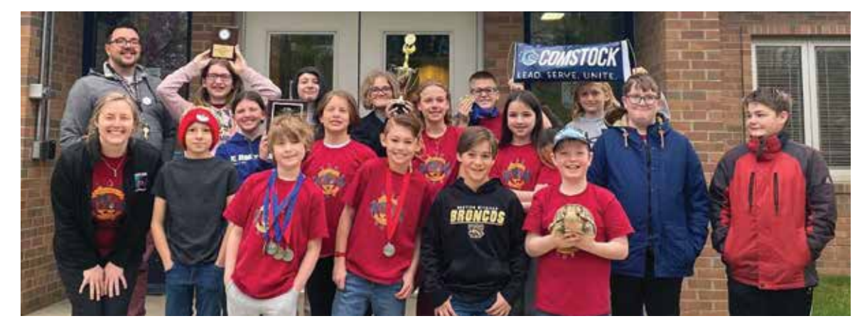
The team celebrates their season by posing at the entrance to the school.

The STEM Academy Science Olympiad Team was named the Division B, Class C State Champions at the Science Olympiad State Championship.