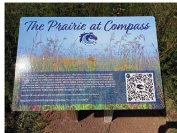
The new Prairie sign.