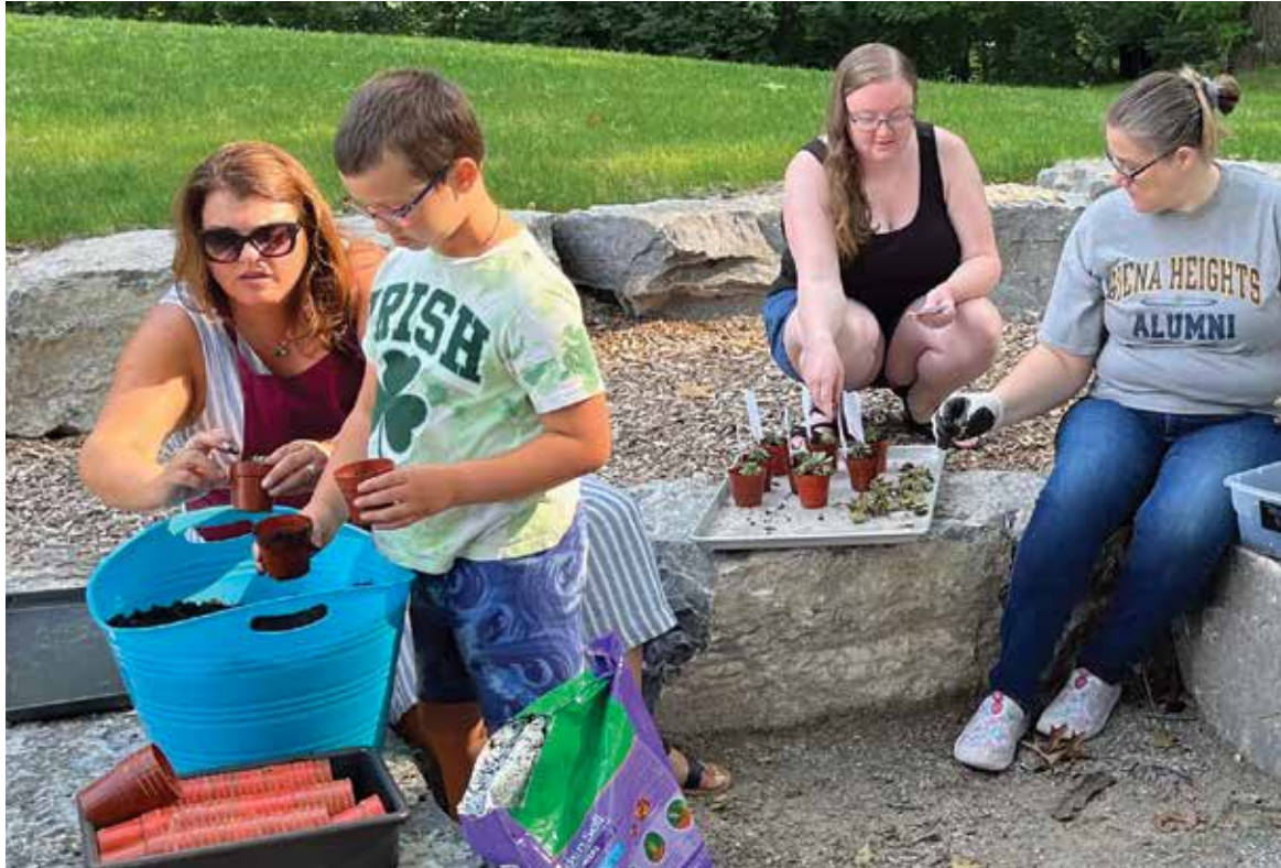
Parents in the CES Outdoor Classroom get the plants ready for teachers.

CES parents showed their appreciation to all CES staff. Meeting in the school's new Outdoor Classroom, parents put together appreciation gifts for the teachers as they returned to the classroom. Each staff member received an adorable "hens and chicks" plant to take home or have in the classroom.