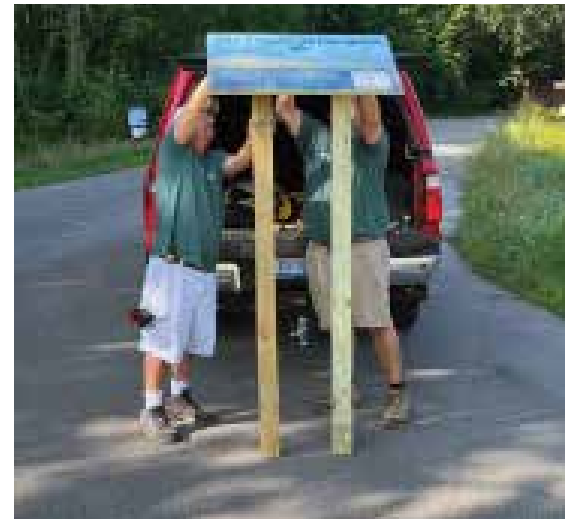
A crew from Kal Blue of Kalamazoo installs the sign at The Prairie at Compass.

The Board of Education and Superintendent Team are thankful to the community for supporting the 2016 bond that made this environmentally-friendly and cost-saving space possible.