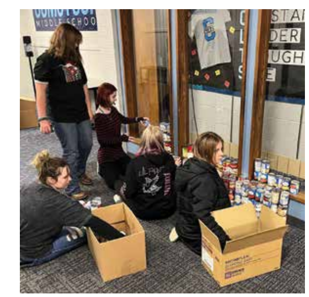
Middle school students pack up canned goods to be donated to the Comstock Community Center.