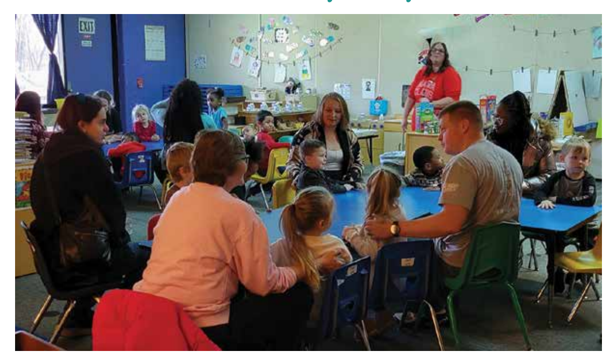
CELA's Great Start Readiness Program classes hosted family days to celebrate cultures around the world. Families participated in talking circles where they described their holiday traditions They also enjoyed healthy snacks and created projects.